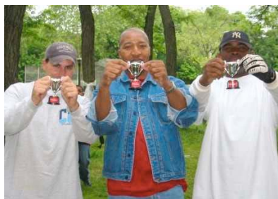
Softball and volleyball champions display their trophies during DJJ's 2004 Employee Appreciation Picnic at Van Cortlandt Park.

The 2004 picnic featured a smorgasbord of delicacies, including hot dogs, hamburgers, potato salad, macaroni salad, tossed salad, watermelon, toasted marshmallows, beverages and more.