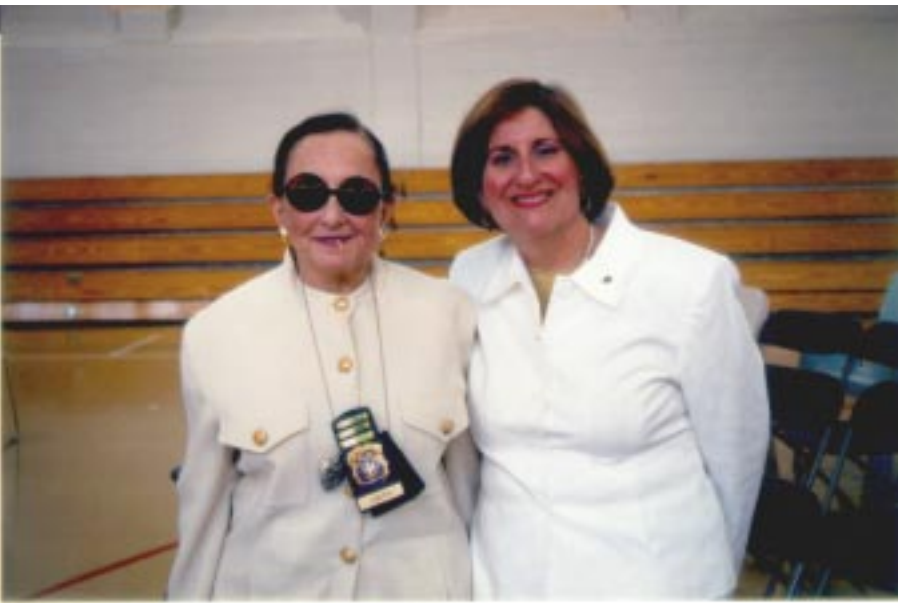
Spring/Summer 2001/Around DJJ