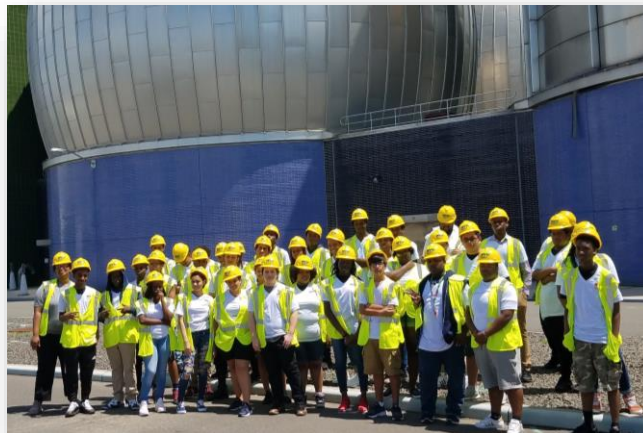
2018 HEAT Team

The HEAT teams share their experiences with the Bronx Community Boards 4 and 5, and Manhattan Community Board 12, residents by contributing their stories to this weekly newsletter as well as on its social media accounts. Follow us on Facebook, Twitter, and Instagram to learn more about what's happening in the neighborhoods and at events throughout the summer.