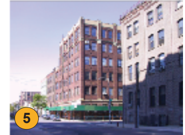
5 Berry and N. 11th Streets