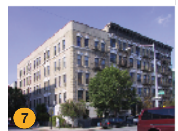
7 Havemeyer and N. 7th Streets