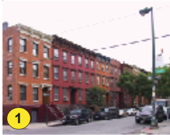
1 Bedford Ave. between N. 8th and N. 9th Streets