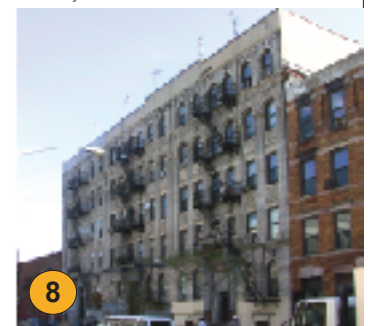
8 Richardson Street between Lorimer and Leonard