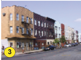
3 Graham Avenue between Newton and Engert Streets