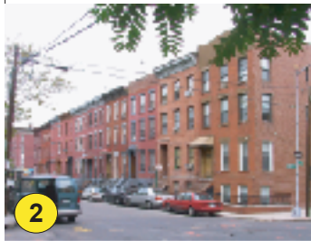
2 Berry between N. 8th and N. 9th Streets