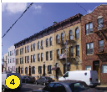
4 Withers Street between Union and Lorimer