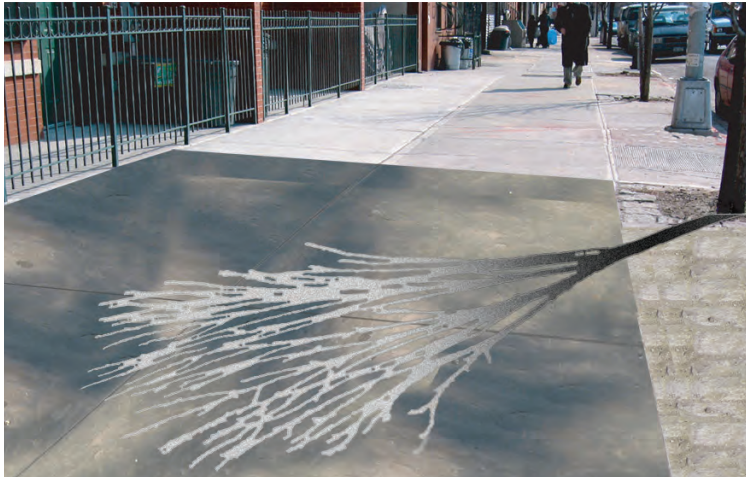
Time Cast, by Nobuho Nagasawa, at the Columbia Street Waterfront District in Brooklyn

PERCENT FOR ART (PERCENT) IS NEW YORK CITY'S PERMANENT PUBLIC ART PROGRAM that commissions and acquires artwork within City-funded capital construction projects. Since its inception in 1982, Percent has commissioned 374 artists for 291 projects at City-owned properties, with 82 commissions awarded during the Bloomberg Administration. These permanent works of art continue to enhance the City's landscape with installations at municipal buildings and adjacent outdoor spaces, schools, transportation hubs, parks, plazas, and streets across the five boroughs.