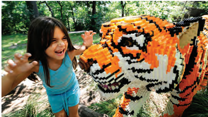
Lego Great Summer Zoofari at the Bronx Zoo

Extreme Kids and Crew Eyebeam Atelier, Inc. F*lt Club F.E.G.S. Fae Projects Falconworks Artists Group Families First Fashion Center BID Fashion Institute of Technology - Accessories Design Department Fashion Institute of Technology - Fine Arts Department Faux Real Theatre Company Figment Project, Inc. Filipino American Human Services, Inc. Flea Theater Flight 18 Floating Archives, Inc. Flushing Council on Culture and the Arts Flux Factory Flux Theatre Ensemble Food Bank For New York City Food First Inc - Family Project, Inc. Fordham University Theatre Department Foresight Films Forever Today, Inc. Fort Greene Senior Citizens Council Fortune Society, Inc. Foundation for Contemporary Arts Foundation for Filipino Artists, Inc. Foundation For Jewish Culture - Six Points Fellowship's NYC Emerging Artists Program