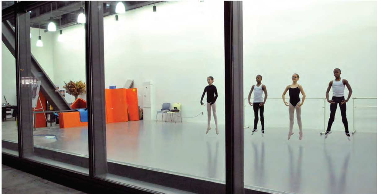
top: Brooklyn Ballet