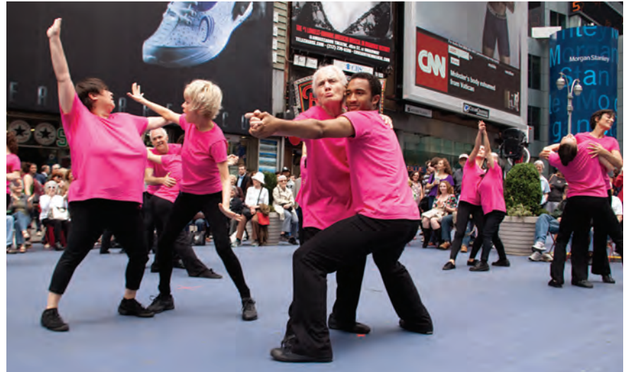
bottom: Dances for a Variable Population's ROUNDUP, presented in Times Square with the Times Square Alliance/Times Square Arts