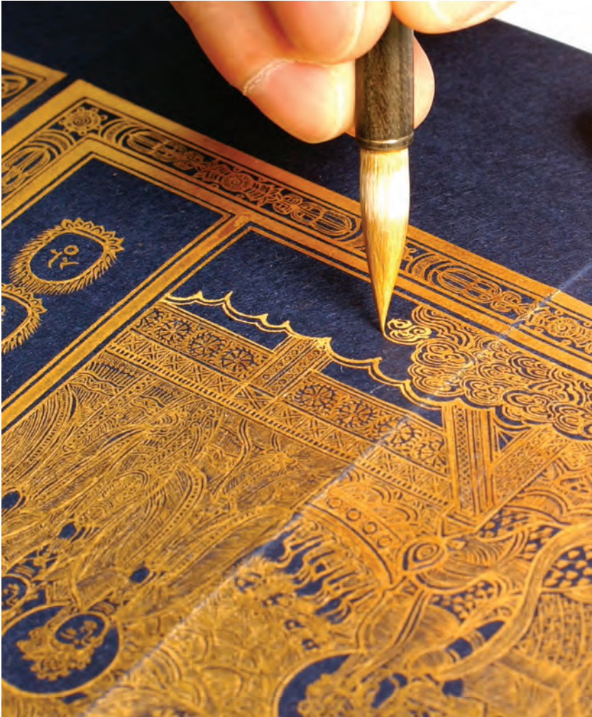
SAGYEONG, Korean Traditional Illuminated Sutra exhibition at Flushing Town Hall, Queens