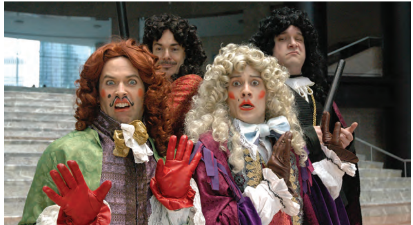
bottom: Playing Moliere at the New York Classical Theatre, Manhattan