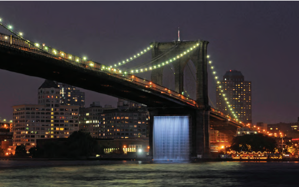
The New York City Waterfalls, by Olafur Eliasson, attracted 1.4 million visitors and generated an estimated $69 million in revenue for New York City