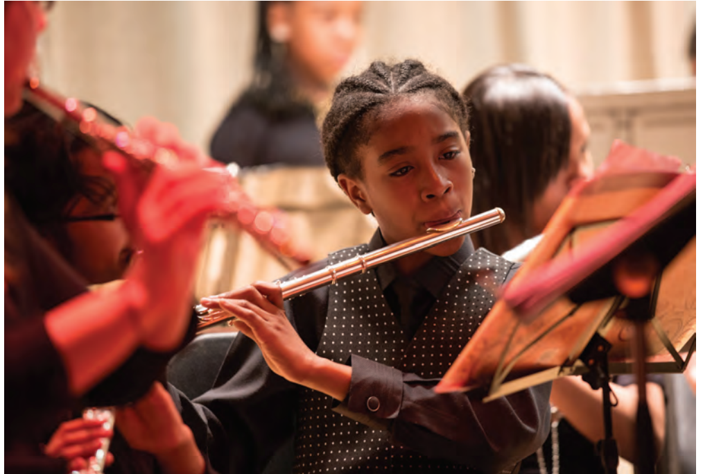
Harmony Program's Spring Recital 2012, at PS 152 in Brooklyn