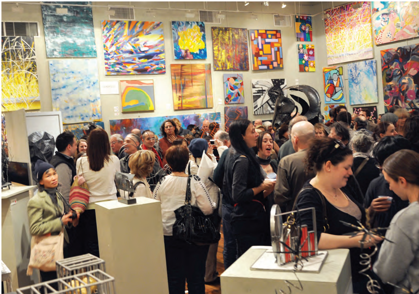
Class Show at the Art Students League of New York Gallery, Manhattan