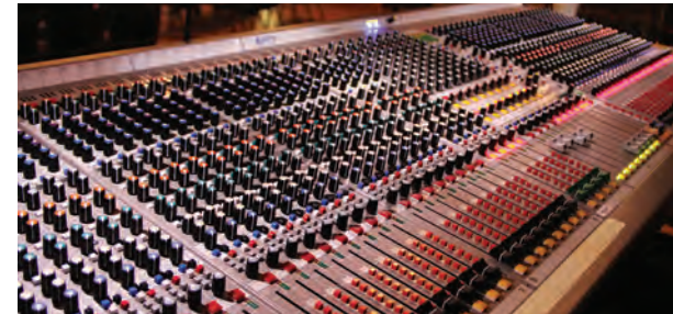
Live sound mixing board in Roulette Intermedium's new facility in Downtown Brooklyn