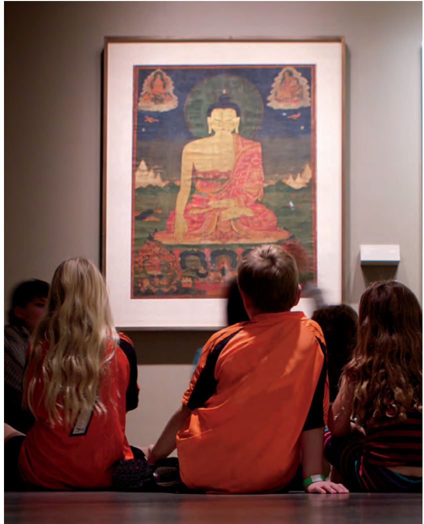
Family Day at the Rubin Museum of Art, Manhattan

PS 038 George Cromwell PS 39 Francis J. Murphy Jr.