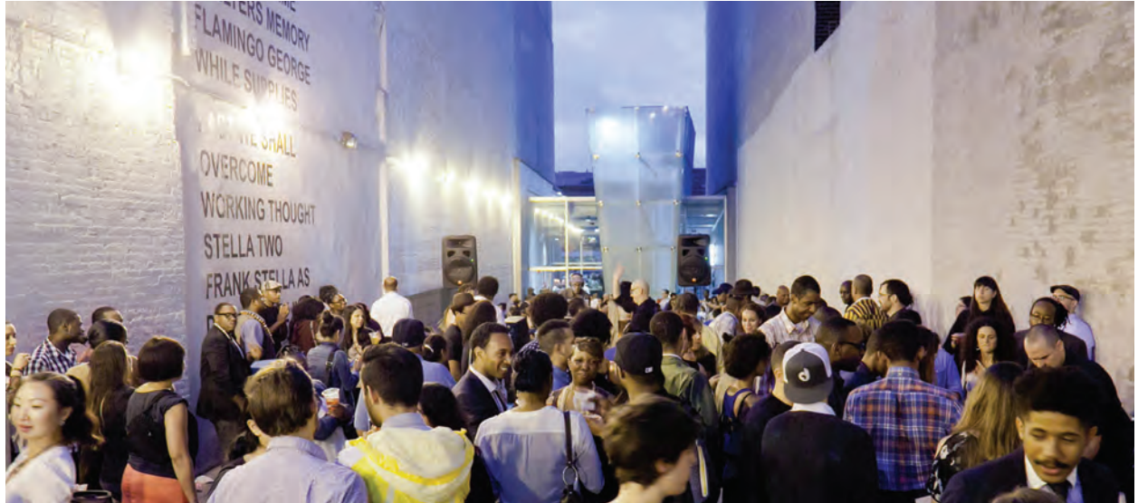
top: Harlem Sculpture Court at the Studio Museum in Harlem, Manhattan