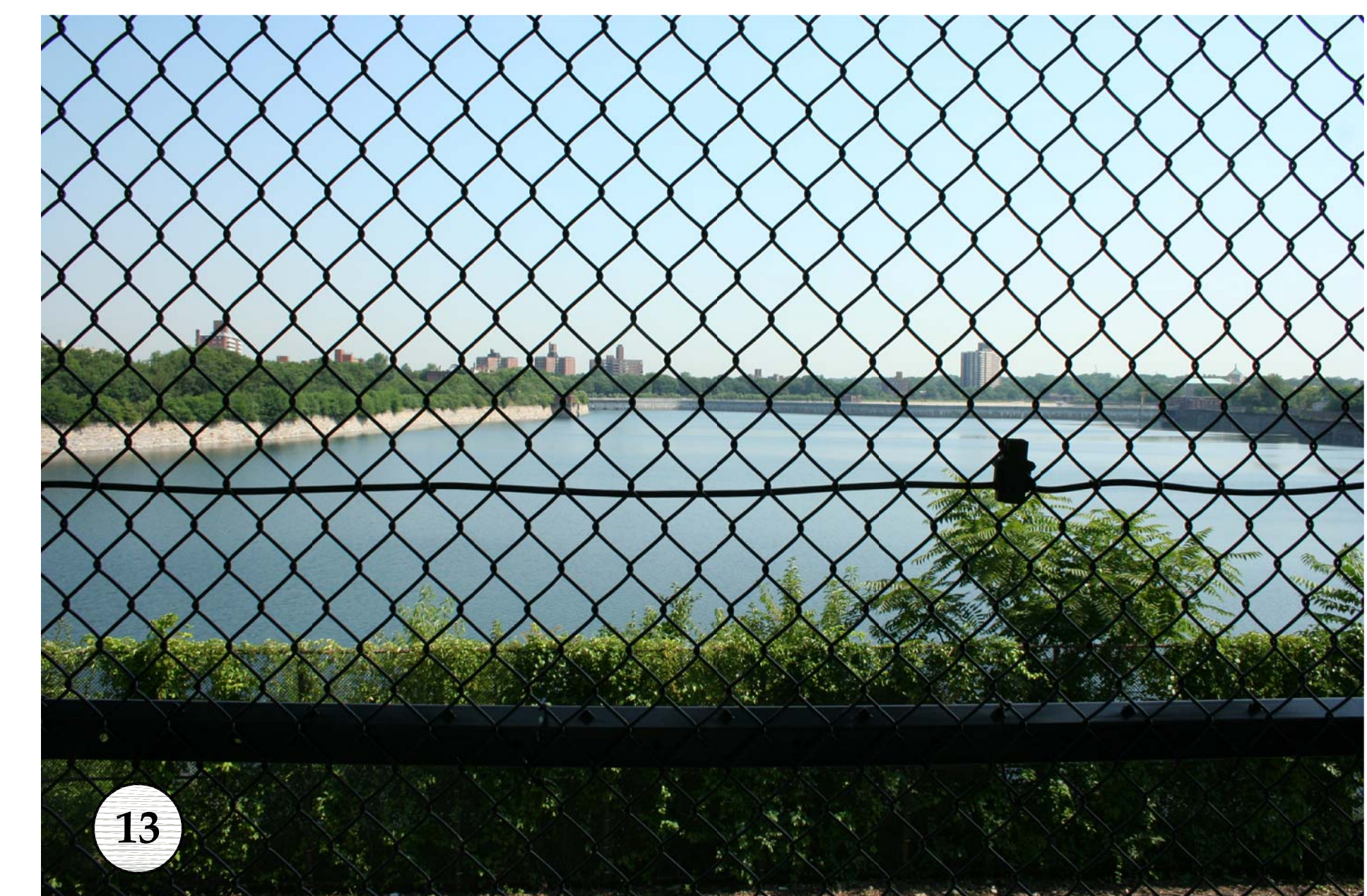
EXISTING CONDITIONS PHOTO IN VICINITY OF RESERVOIR AVENUE PLAN 'A' WITH VIEW OF RESERVOIR