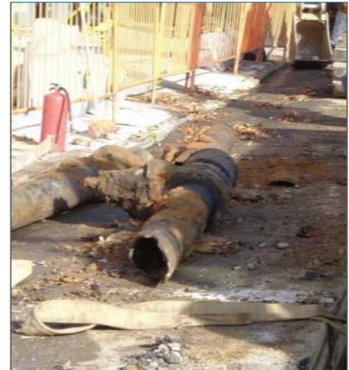
Waldo Avenue Water Main Work under Progress Rusty Cast Iron Pipe being replaced with Ductile Iron Pipe