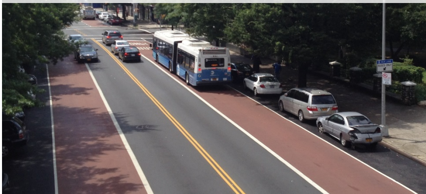
Webster Ave, The Bronx