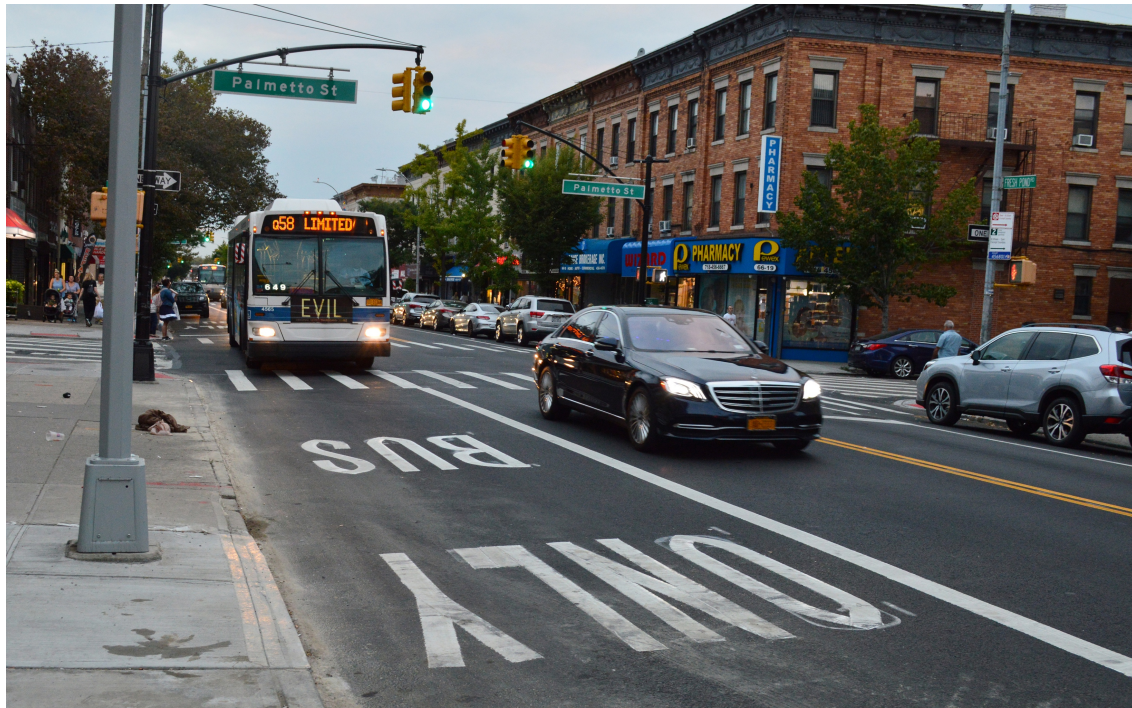
Example of bus lane without red paint