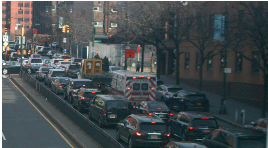
149 th St & Walton Ave, 3/5/20