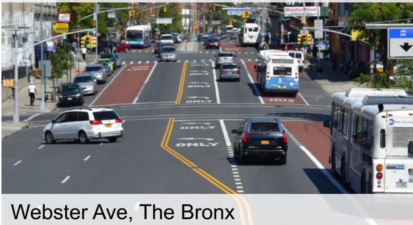
Webster Ave, The Bronx