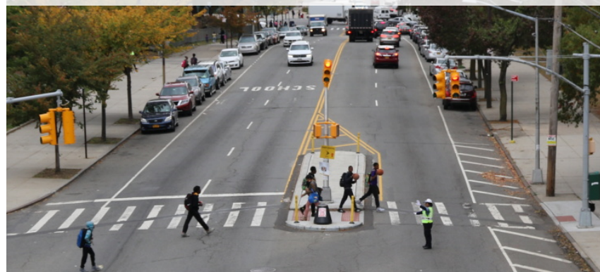
Baychester Ave, The Bronx