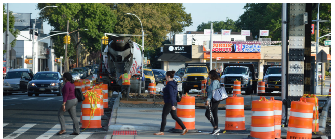
Pedestrian safety improvements Completed, ongoing & upcoming - Ex. Cross Bay Blvd