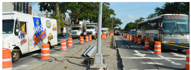
Bus island station construction Completed 10/10 - Ex. Woodhaven Blvd

For more information, visit nyc.gov/brt .