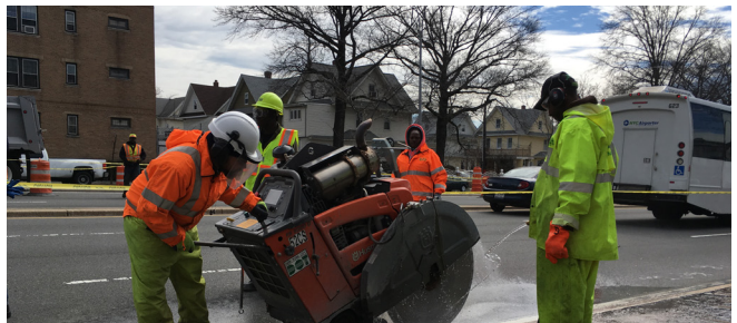
Median and slip lane reconstruction Completed & ongoing - Ex. Woodhaven Blvd