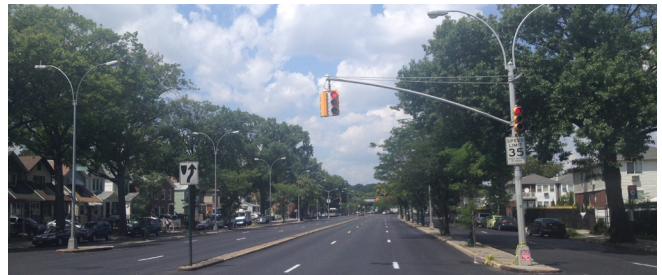
Fresh asphalt and markings Ongoing & upcoming - Ex. Woodhaven Blvd