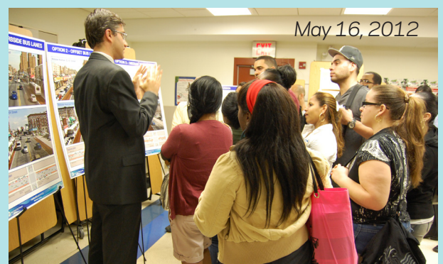
Public Open House participants consider different design options for Webster Avenue