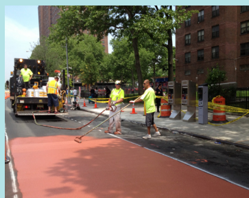
Red painted bus lanes