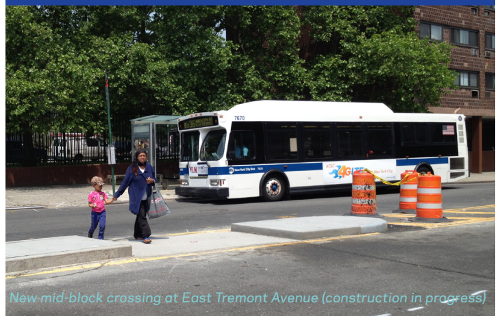
New mid-block crossing at East Tremont Avenue (construction in progress)

Improved street crossings with new pedestrian refuges and medians along Webster Avenue