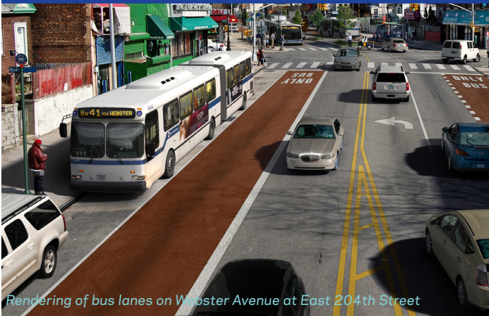
Rendering of bus lanes on Webster Avenue at East 204th Street

Bus lanes bring faster and more reliable service to the 20,000 Bx41 riders