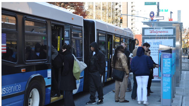
Passengers paying their fare on the M15 SBS in Manhattan