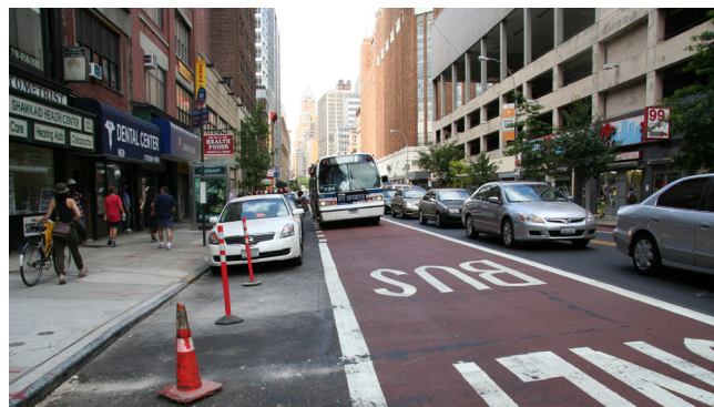
Offset bus lanes on Livingston Street in Brooklyn