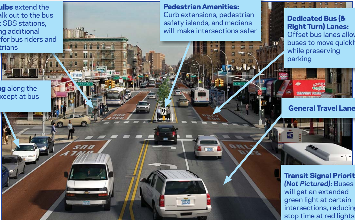
Design of typical conditions on Webster Avenue

Transit Signal Priority (Not Pictured): Buses will get an extended green light at certain intersections, reducing stop time at red lights