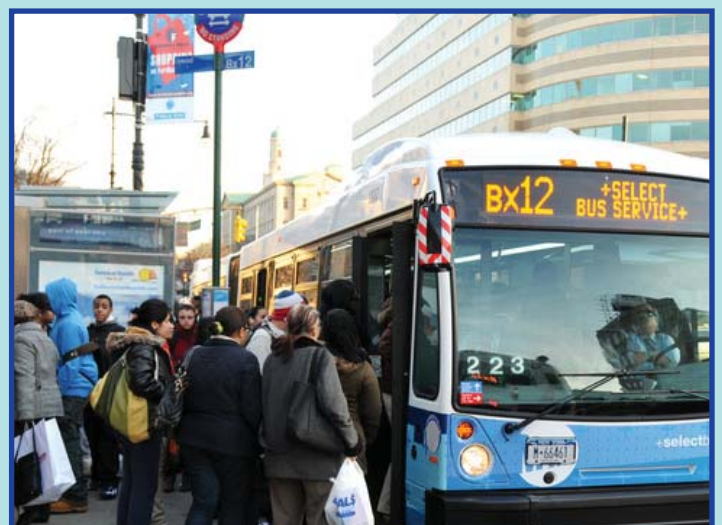
Bx12 SBS on Fordham Road

DOT and NYCT hope to achieve similar results on Webster Avenue.