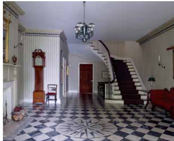
The Gracie Mansion Foyer was constructed during a circa 1810 expansion of the house which provided the Gracie family with more room in which to entertain during their renowned parties. The Foyer is known for its painted trompe l'oeil floor which gives the illusion of marble.

In 2002 the interior and exterior of Gracie Mansion were structurally reinforced and again restored to their original grandeur under the guidance of the Gracie Mansion Conservancy. The restoration, which was made possible through private donations, transformed Gracie Mansion into the "People's House" providing increased public access to the house and its collection of fine and decorative arts. In addition to the numerous civic and community events hosted by the City at Gracie Mansion, tours of the house are offered year-round. Public art is often displayed on the lawns of the house for the enjoyment of visitors.