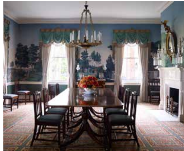
The Dining Room of the house features an historic scenic wallpaper, Les Jardins Français manufactured by Zuber in the 1830s.

In 1981, recognizing the extensive use of the house and the need for a comprehensive restoration, Mayor Edward I. Koch established the Gracie Mansion Conservancy. The Conservancy, a not-for-profit corporation, was formed to preserve, maintain, and enhance Gracie Mansion. It was under the Conservancy's leadership that a major renovation and restoration project was undertaken from 1981-84. While preservation of the historic character of the house was integral to the planning process, the restoration plan also strove to accommodate the house to its modern day use. During the administrations of Mayors David N. Dinkins, Rudolph W. Giuliani, and Michael R. Bloomberg, the Gracie Mansion Conservancy continued to expand the collection of fine and decorative art to be displayed at the house.