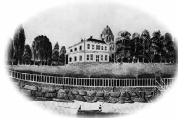
The country home of Archibald Gracie by an unidentified artist, circa 1810.

In 1896, the City of New York appropriated the property from the Wheaton family due to the non-payment of taxes. Eleven acres of the former Gracie estate provided the nucleus of the newly established East End Park, later renamed for Carl Schurz, a German immigrant who had been editor of the New-York Evening Post , a United States Senator from Missouri, and served as Secretary of the Interior under President Rutherford B. Hayes. In the early days of the twentieth century, Gracie Mansion was used by the City’s Department of Parks as a storage area, comfort station, and an ice cream parlor for the park; over the next two decades the house deteriorated rapidly as a result of hard use and neglect. By 1920, various civic groups, realizing the historic worth of the structure, lobbied to have it restored. In 1923, Gracie Mansion became the first home of the Museum of the City of New York. Having outgrown the space at Gracie Mansion, the museum moved to its present location on Fifth Avenue at 103rd Street in 1932. Gracie Mansion once again fell into a state of disrepair.