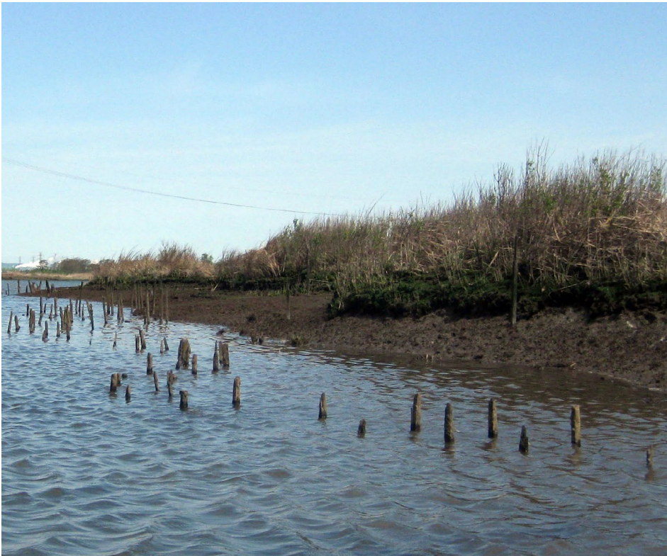
View from Prall's Island, west of the Arthur Kill ESMIA

A full description of the New York City Waterfront Revitalization Program and accompanying documents are available at www.nyc.gov/wrp