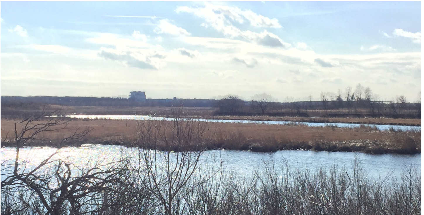
A diversity of wetland habitats comprise the Arthur Kill Ecologically Sensitive Maritime and Industrial Area (ESMIA)