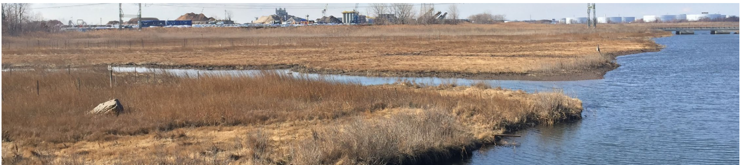
Saw Mill Creek Marsh

Additional development priorities were identified in the "Working West Shore 2030" report, released in 2011, including support for maritime and industrial uses, diversification of commercial employment, improved transportation and access, and preservation and linkage of natural features and open space.