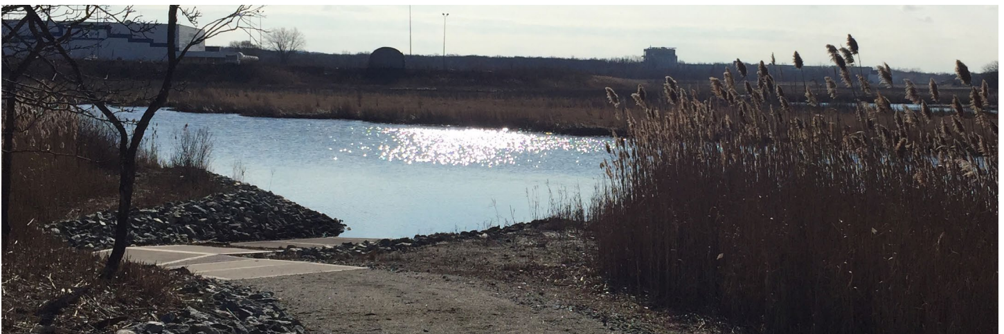
Old Place Creek Tidal Wetland Area

For more information on the Sunset Park Material Recovery Facility , visit the Sims Municipal Recycling website.