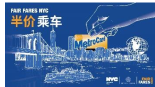
Chinese Graphic for Twitter