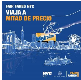
Spanish Graphic for Facebook/Instagram