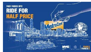
English Graphic for Twitter