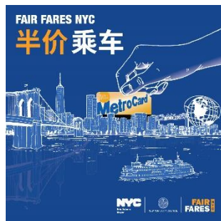
Chinese Graphic for Facebook/Instagram