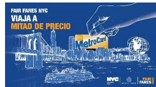
Spanish Graphic for Twitter