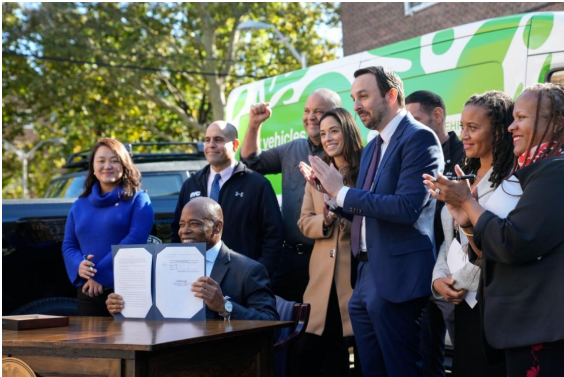
NYC Mayor Adams, First Deputy Mayor Wright, DCAS Commissioner Pinnock, DCAS Deputy Commissioner Kerman and others at the signing.

On October 23, 2023, NYC Mayor Eric Adams signed Intro 279 , which codifies the City's current fleet electrification efforts into law. The law accelerates the goal date for full fleet electrification to 2038 with a goal of 2035 for the City's light and medium duty units. The law was signed at the Ravenswood New York City Housing (NYCHA) Complex in Astoria, Queens. The mayor also announced a fleet sustainability partnership between DCAS and NYCHA, which we will discuss in our next newsletter.