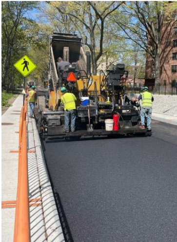
← Binder Paving on Pelham Parkway North Service Road between Bronxwood Ave. & Wallace Ave.