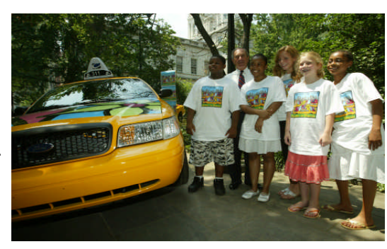
Mayor Bloomberg joins eager student volunteers in announcing the year-long Garden in Transit project.

the healing power of art. Mayor Michael R. Bloomberg announced the Garden In Transit project on July 18, 2006. Beginning September 2006, the project united school-age children with thousands of volunteers from corporations and community programs to begin the process of painting large, colorful flowers onto decals that will be placed onto thousands of yellow medallion taxicabs. The decorated taxicabs will constitute a mobile art exhibit that will be on display between September and December 2007. "Garden in Transit" (named for the view of the moving flowered panels from above) is the latest concept of Ed and Bernie Massey, founders of Portraits of Hope.