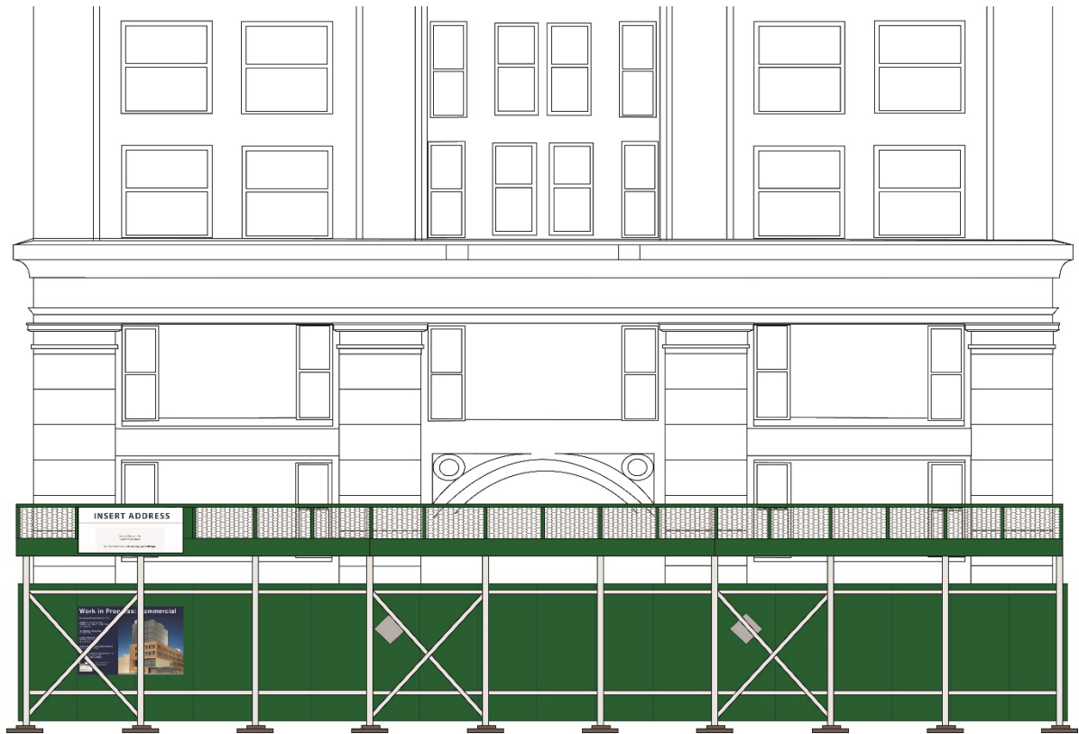
FIGURE 3301.9.2.2 PANEL POSTING ELEVATION DIAGRAM

3301.9.2.3 Sidewalk shed parapet information panel material. Sidewalk shed parapet information panels shall be constructed out of a durable and weatherproof material such as vinyl, plastic, or aluminum, and such material shall be flame retardant in accordance with NFPA 701 or listed under UL 214.